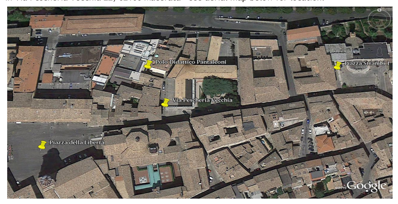
The following is a more comprehensive map of the city center:

The onsite sessions will be held in Aula Verde of "Polo Didattico Pantaleoni" (second floor), located in Via Pescheria Vecchia 22, 62100 Macerata - see aerial map below for location.